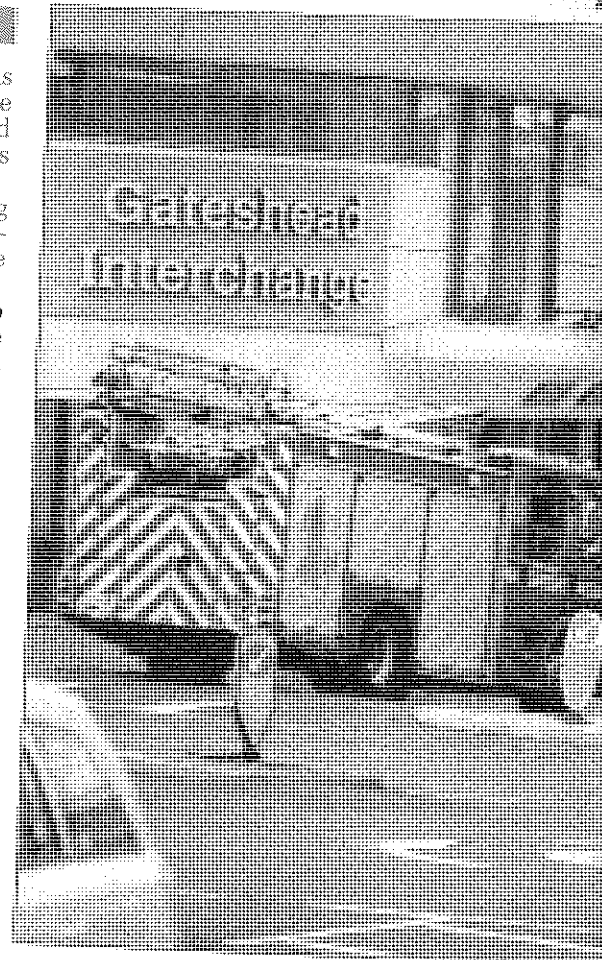
EVACUATION The emergency services outside Ga

said: "We were just going along on the Metro and then the Metro got stuck."