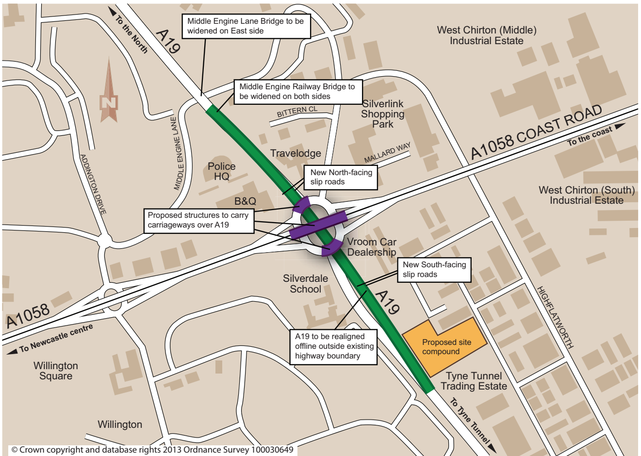
The proposed route