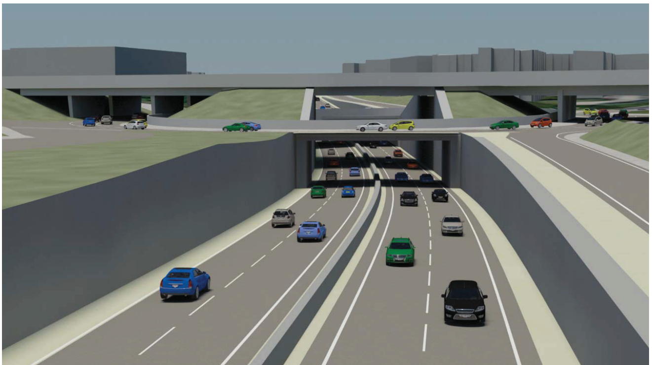
View of proposed junction looking North