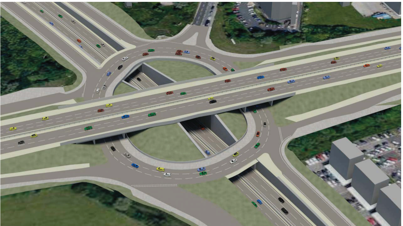
Overview of proposed junction